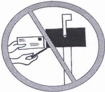
Don't serve it by mail!

(If a law enforcement agency or the process server uses a different proof-of-service form, make sure it lists the forms served.)